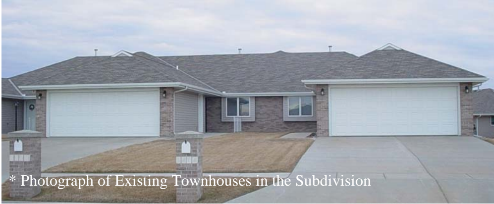
* Photograph of Existing Townhouses in the Subdivision