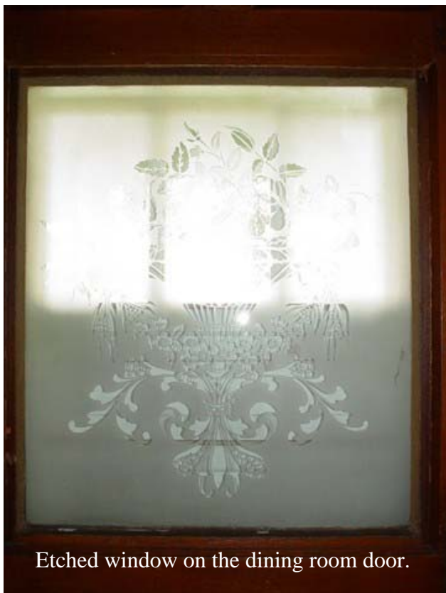
Etched window on the dining room door.

Information herein deemed reliable, but not guaranteed.