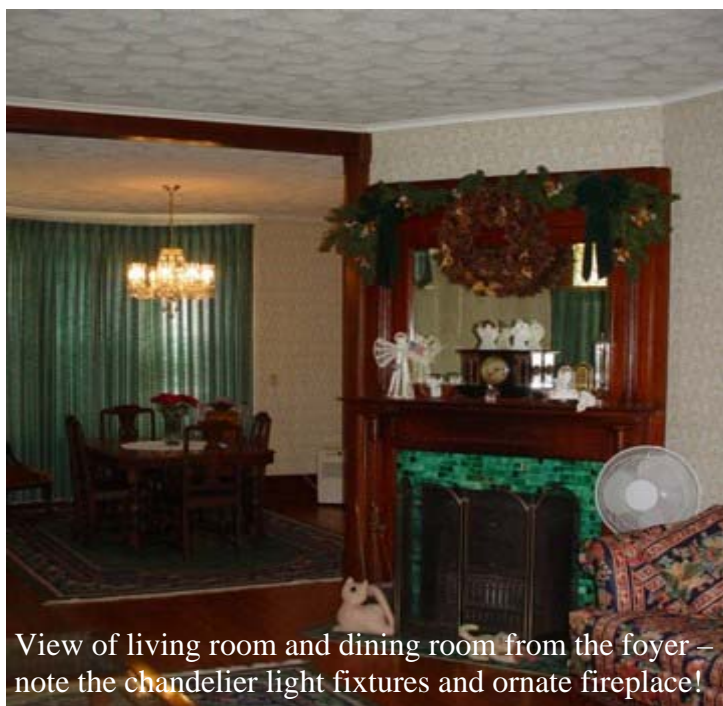
View of living room and dining room from the foyer – note the chandelier light fixtures and ornate fireplace!

Information herein deemed reliable, but not guaranteed.